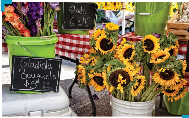
Community Farmer's Market

Getting back to 350 is a unique opportunity to remake our communities in ways that are healthier, more locally self-sufficient, and honor traditional and indigenous wisdom. We can get away from relying so heavily on sources of fuel and food that comes from far away, and instead grow more of our own food locally, ride bikes and public transit, depend on local energy systems like wind and solar, and create economies that aren't as dependent upon limitless growth. These types of solutions help create communities that are not only friendlier to our climate, but are also healthier for our children's lungs and our collective well being.